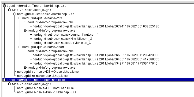
Figure 2: The local information tree on two resources. The first machine bambi.hep.lu.se provides both computing, storage and data indexing services while the second resource hathi.hep.lu.se hosts two storage elements.